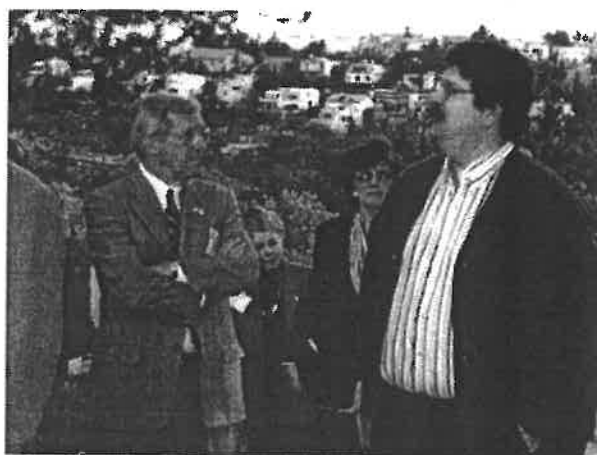
GOVERNOR SUNDQUIST AND MEMBERS OF THE MISSION AT YAD VASHEM IN JERUSALEM