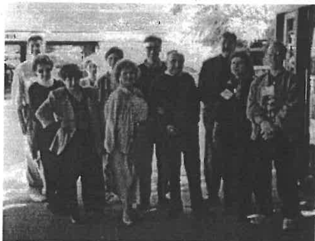
ARTS AND CULTURE GROUP OF GOVERNOR'S MISSION IN TEL AVIV

ally more interested in seeing Israel's cultural institutions, so I switched. The schedule which the Israeli Foreign Ministry had designed for us made for long days, chock full of interesting appointments with all sorts of cultural institutions.