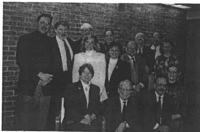
TENNESSEE COMMISSION ON HOLOCAUST EDUCATION, NASHVILLE, SPRING 1997